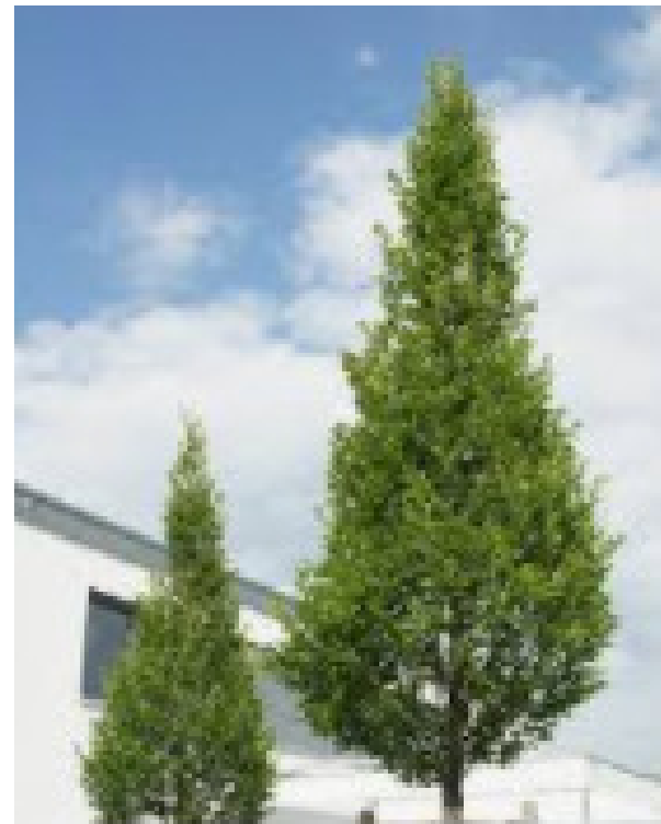
Pyramidal European Hornbeam